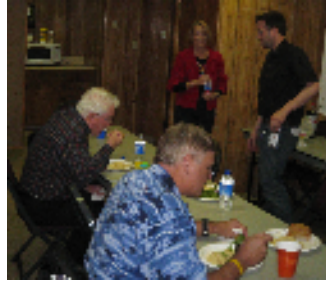
Lunch was provided by PHEP

The group spent time looking over equipment that is ready to be utilized in the event of a public health emergency. They shared ideas, discussed mutual goals and operational strategies.